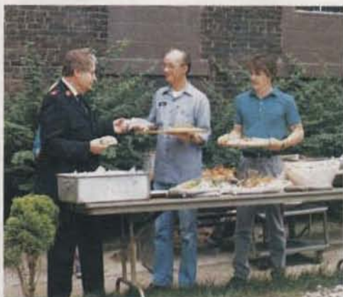
On warm days the mini-park is a cool retreat for cookouts and family visiting.