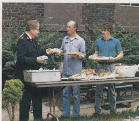
On warm days the mini-park is a cool retreat for cookouts and family visiting.