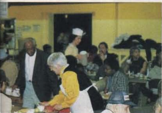
...meals over the holidays.