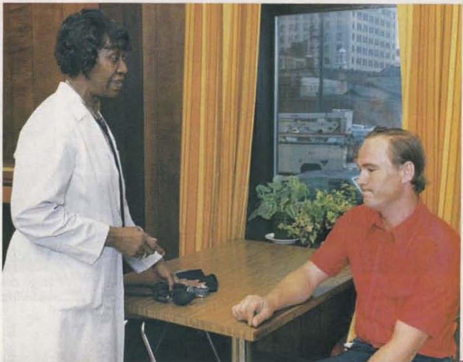
Medical treatment is one important part of the kaleidoscope of activities at Harbor Light. The center is equipped with two medical clinics.