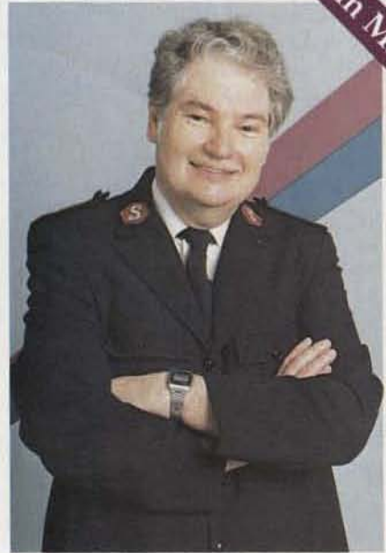
"The real glamor of Harbor Light is seeing the changes in the lives of our people. We pray that the common bond for all of us is that we have found God makes the difference, and that with His help all the rest of our days can be worthwhile."