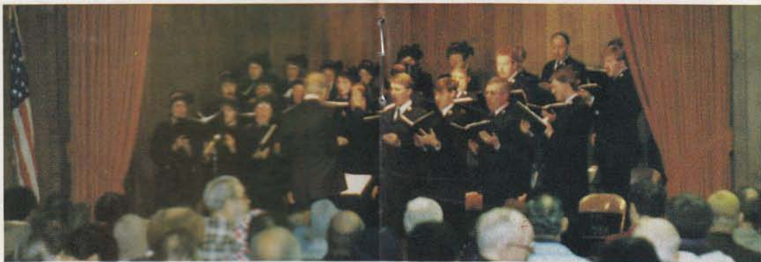
The International Staff Songsters were treated to their first traditional American Thanksgiving dinner following a concert on this holiday at the Harbor Light Center.