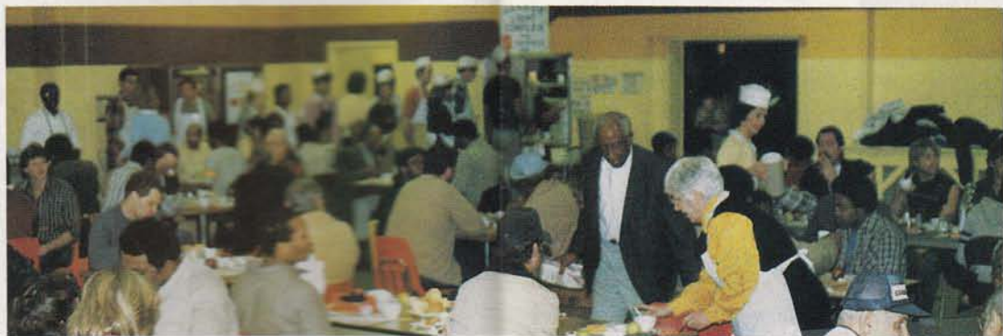
Volunteers serve close to 1,000 meals over the holidays.