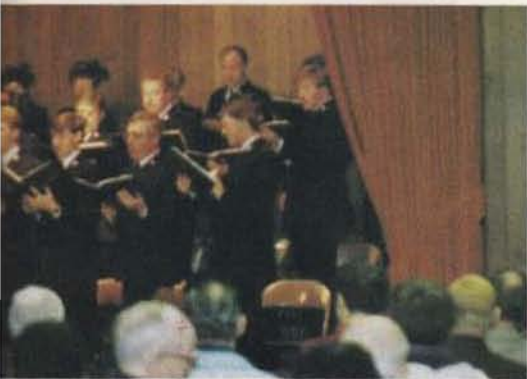
...treated to their first traditional ...ing a concert on this holiday at the