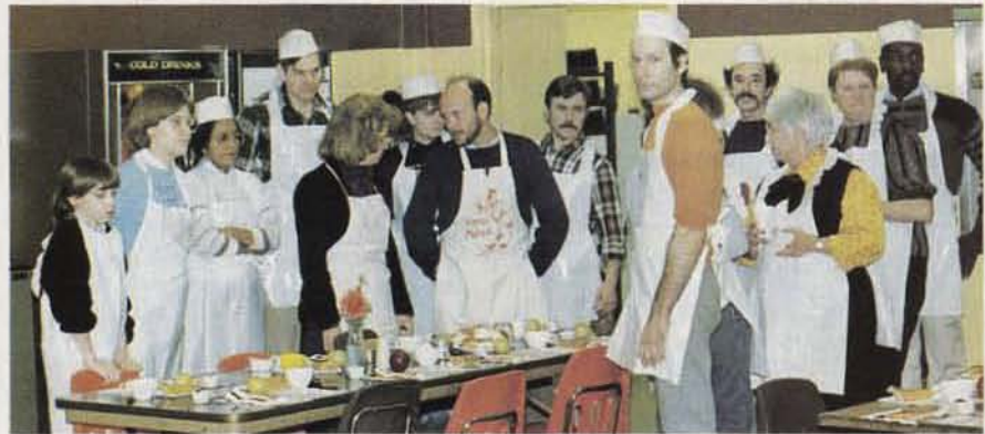
Over 150 volunteers provide crucial support for Harbor Light's many programs.