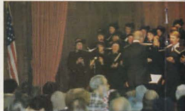
The International Staff Songsters were treated to an American Thanksgiving dinner following a performance at Harbor Light Center.