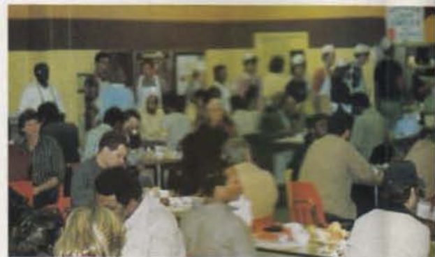
Volunteers serve close to 1,000 meals each day.