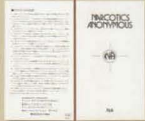
The first Japanese translation of IP#19 was withdrawn in the early 1980s and republished in 2003.

IP#22, Welcome to NA , comes out this year. The Fourth Edition of the Basic Text is published.