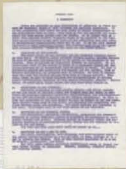
NA's first IP, Another Look, was run off on a mimeograph machine. In 1968, it would be published in The Mass, NA's newsletter.

Another Look, our earliest known IP, is first distributed in groups this year.