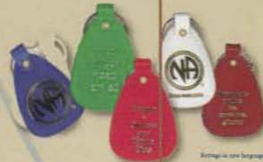
Keytag in one language

It Works: How and Why , NA's book on the Twelve Steps and Traditions, is published. The gift edition of Just for Today is produced. Translations are going strong: the Basic Text comes out in both German and Brazilian, and IP#1 is published in Norwegian. And eternity medallions are produced to honor addicts who have died clean.