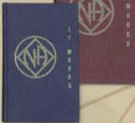
Frontboard editions of the red-covered Basic Text were sold for $22.00 to raise money for printing. The blue edition sold for $4.00. Later this year, the Second Edition of the Basic Text was published.

A banner year for NA literature, 1983 saw the publication of the Basic Text (First and Second Editions), the Italian Little White Booklet (later withdrawn), and ten IPs, including Just for Today: Living the Program; An Approach to the Fourth Step Inventory; Sponsorship; The Triangle of Self-Obsession; Youth and Recovery; One Addict's Experience with Acceptance, Faith, and Commitment; For the Newcomer; and Use of Medication in Recovery.