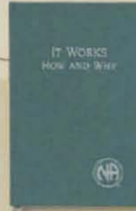
The first gift edition of It Works

We put out our first Braille literature this year. IP#1. IP#1 is published in Brazilian as well. The gift edition of It Works comes out. Eighteen-month and multiple-year keytags are produced.