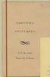
The earlier precursor to the Little White Booklet.

NA's first piece of literature, the Little Brown Booklet, is published this year.