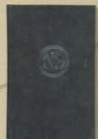
The commemorative album was published to celebrate the distribution of the Little White Book. 1983.