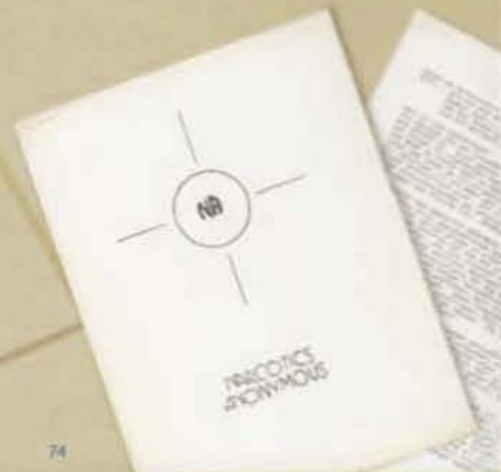
NA's first publication today, the Little White Booklet, provides an introduction to NA.