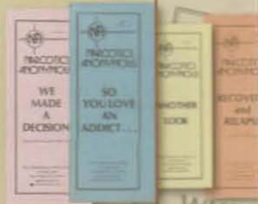
IPD and a new welcome to the World Service Conference in 1967.

This is the year of the first World Service Conference and where copyrights were filed for our first pamphlets, including Who, What, How, and Why; The Group; Another Look; and Recovery and Relapse.